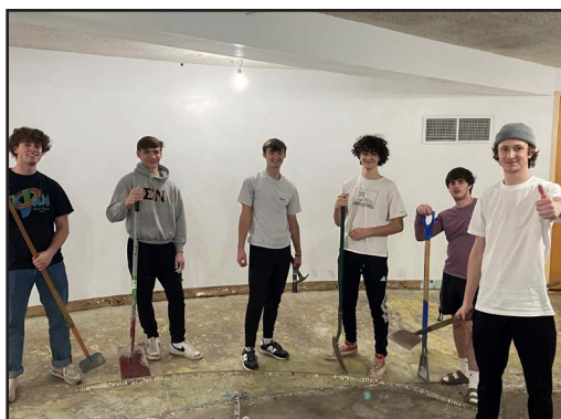
Sigma Nu partnered with Sigma Kappa to serve at the local Dream Center in downtown Peoria. Volunteers painted and helped tear up the flooring to prep space for a new indoor playground!

Thank you to all who attended our alumni golf outing. We are looking forward to continuing this tradition again next year.