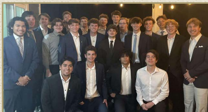
The men of Sigma Nu enjoy the annual White Rose Formal.