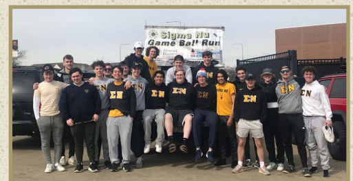
Almost all our brothers participating in this year's Game Ball Run!