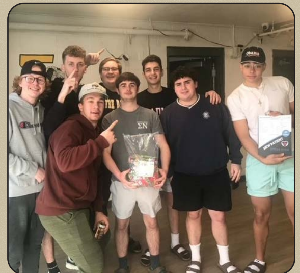
The junior class won the Etiquette Relay Race for spring 2023.