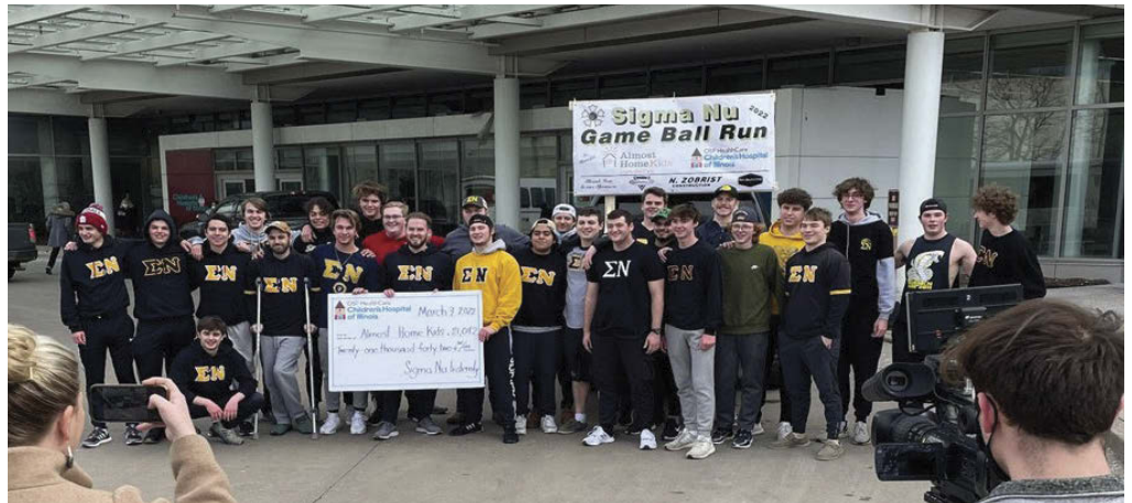
Zeta Phi presenting the check to OSF Children's Hospital after the Game Ball Run.