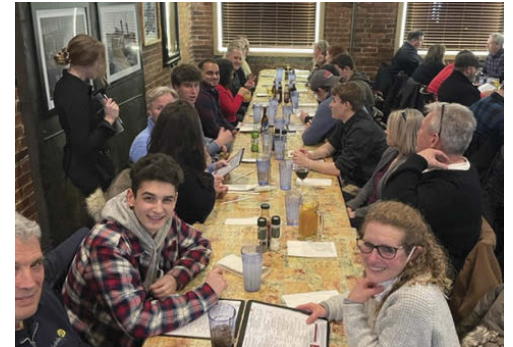
Zeta Phi brothers and their parents at Alexander's Steakhouse in Peoria.