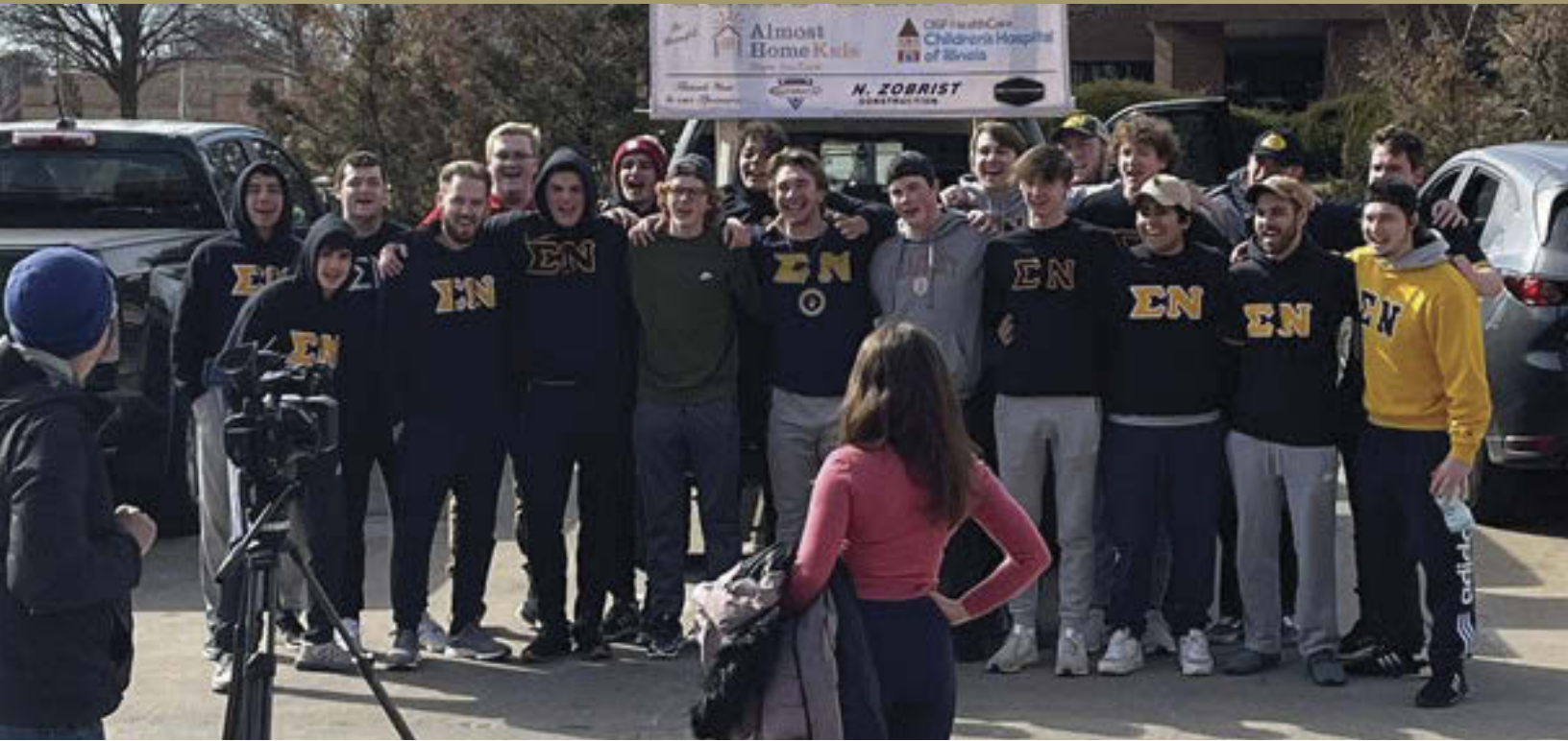
Brothers promote the Sigma Nu Game Ball Run philanthropy event on the local news, shouting the event catchphrase: "For the kids!"